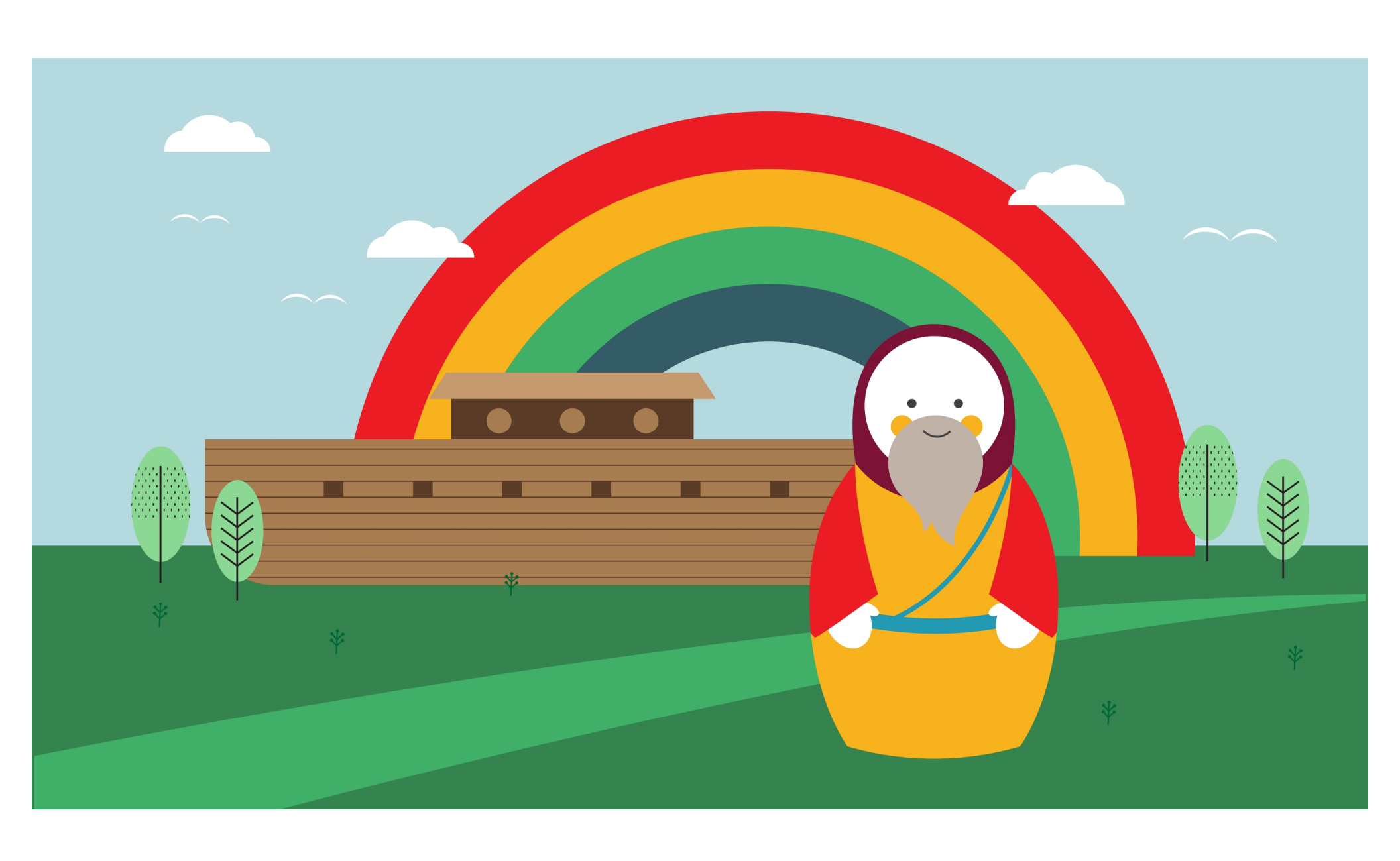
Faith in God's Promises